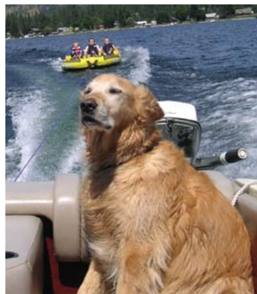
Buddy soaking up some rays.